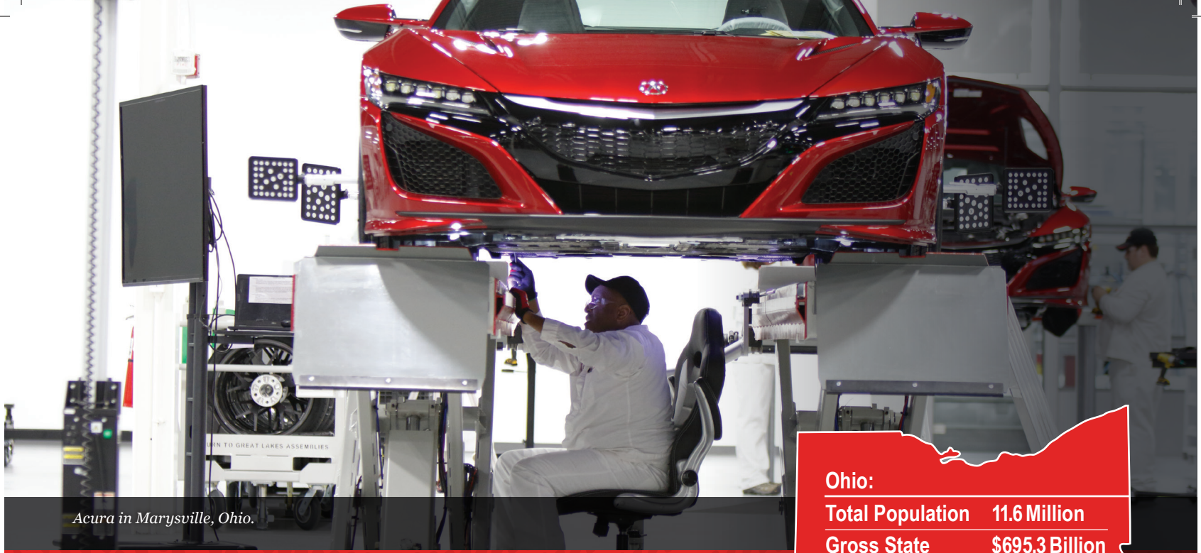
Acura in Marysville, Ohio.